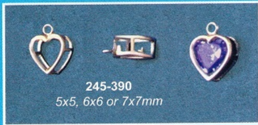
245-390 5x5, 6x6 or 7x7mm