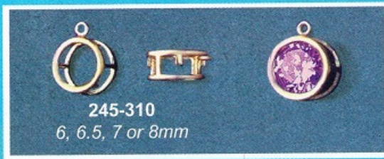
245-310 6, 6.5, 7 or 8mm