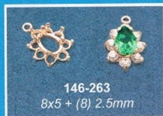
146-263 8x5 + (8) 2.5mm