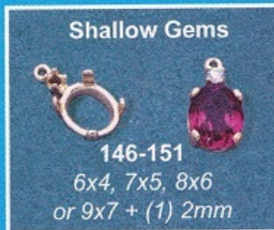
Shallow Gems 146-151 6x4, 7x5, 8x6 or 9x7 + (1) 2mm