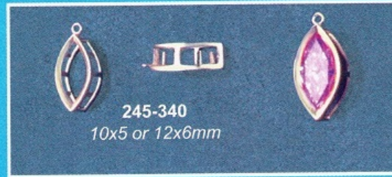
245-340 10x5 or 12x6mm