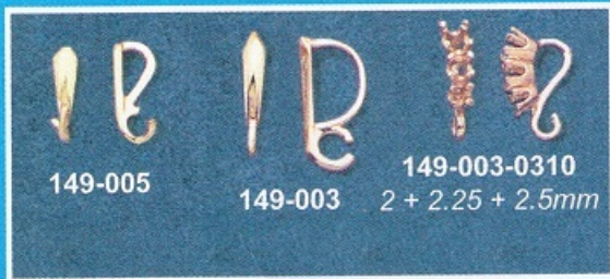
149-005 149-003 149-003-0310 2 + 2.25 + 2.5mm

Create Your Own Unique Designs Using Combinations of Dangle Bails and Dangle Pendants and Earrings! ...More Styles on the Previous Pages...