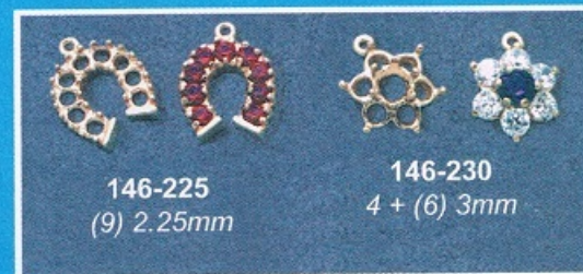
146-225 (9) 2.25mm