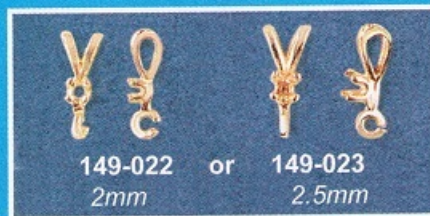
149-022 or 149-023 2mm 2.5mm

The Dangle Bails on This Page Fit the Smaller Dangle Loops on the Dangle Settings on this Page...