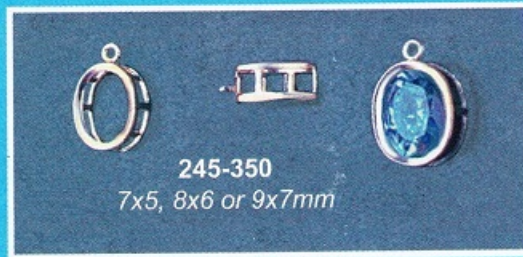
245-350 7x5, 8x6 or 9x7mm