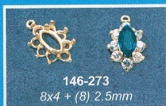
146-273 8x4 + (8) 2.5mm