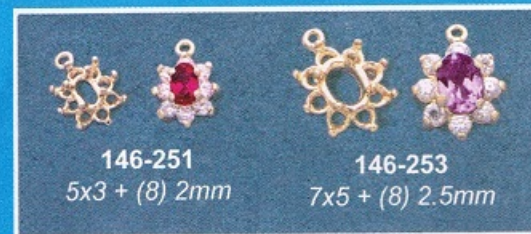
146-251 5x3 + (8) 2mm