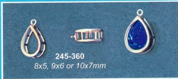
245-360 8x5, 9x6 or 10x7mm