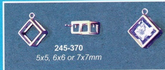
245-370 5x5, 6x6 or 7x7mm