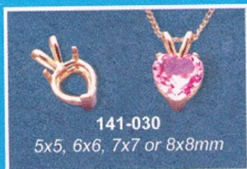
141-030 5x5, 6x6, 7x7 or 8x8mm