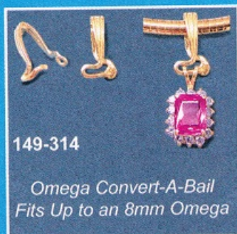
149-314 Omega Convert-A-Bail Fits Up to an 8mm Omega