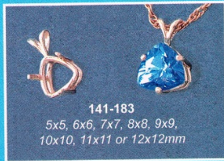
141-183 5x5, 6x6, 7x7, 8x8, 9x9, 10x10, 11x11 or 12x12mm