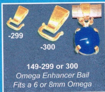
-299 -300 149-299 or 300 Omega Enhancer Bail Fits a 6 or 8mm Omega