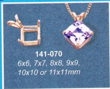
141-070 6x6, 7x7, 8x8, 9x9, 10x10 or 11x11mm