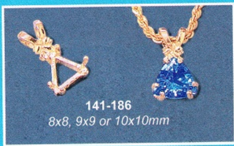
141-186 8x8, 9x9 or 10x10mm