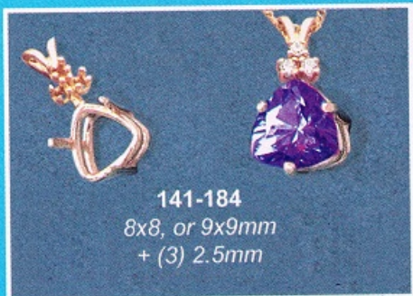
141-184 8x8, or 9x9mm + (3) 2.5mm