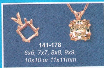
141-178 6x6, 7x7, 8x8, 9x9, 10x10 or 11x11mm