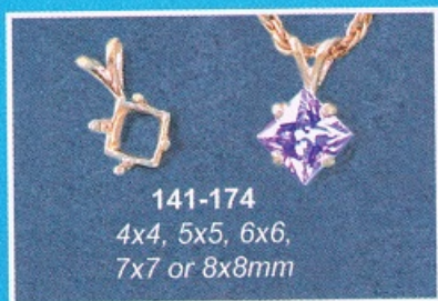
141-174 4x4, 5x5, 6x6, 7x7 or 8x8mm