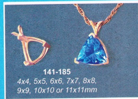
141-185 4x4, 5x5, 6x6, 7x7, 8x8, 9x9, 10x10 or 11x11mm