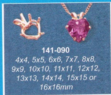
141-090 4x4, 5x5, 6x6, 7x7, 8x8, 9x9, 10x10, 11x11, 12x12, 13x13, 14x14, 15x15 or 16x16mm