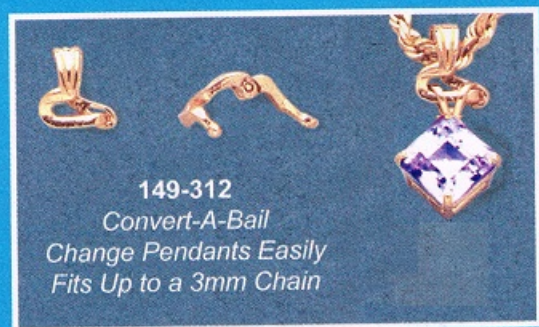
149-312 Convert-A-Bail Change Pendants Easily Fits Up to a 3mm Chain