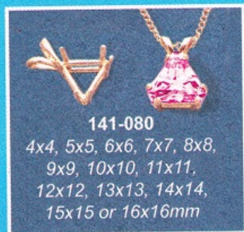
141-080 4x4, 5x5, 6x6, 7x7, 8x8, 9x9, 10x10, 11x11, 12x12, 13x13, 14x14, 15x15 or 16x16mm