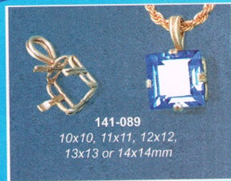
141-089 10x10, 11x11, 12x12, 13x13 or 14x14mm