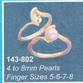
143-802 4 to 8mm Pearls Finger Sizes 5-6-7-8