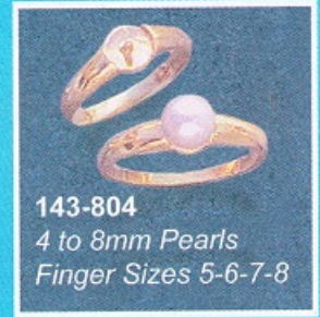
143-804 4 to 8mm Pearls Finger Sizes 5-6-7-8