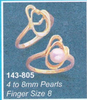
143-805 4 to 8mm Pearls Finger Size 8