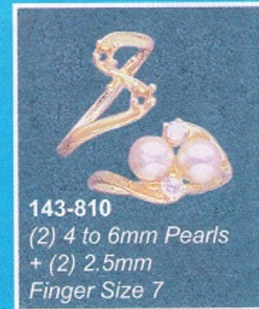
143-810 (2) 4 to 6mm Pearls + (2) 2.5mm Finger Size 7