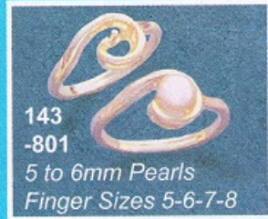
143-801 5 to 6mm Pearls Finger Sizes 5-6-7-8