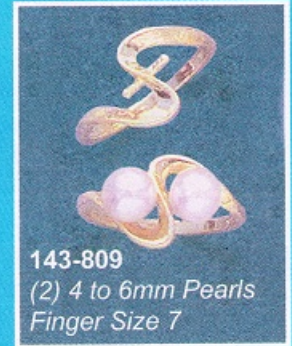
143-809 (2) 4 to 6mm Pearls Finger Size 7