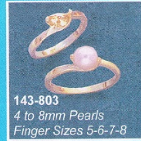
143-803 4 to 8mm Pearls Finger Sizes 5-6-7-8