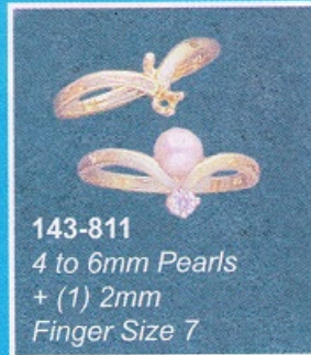
143-811 4 to 6mm Pearls + (1) 2mm Finger Size 7