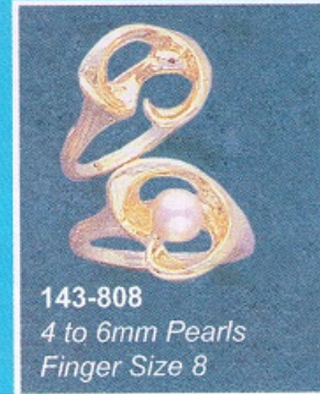
143-808 4 to 6mm Pearls Finger Size 8