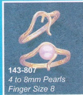
143-807 4 to 8mm Pearls Finger Size 8