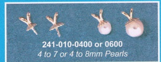
241-010-0400 or 0600 4 to 7 or 4 to 8mm Pearls