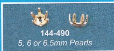
144-490 5, 6 or 6.5mm Pearls