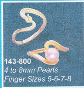
143-800 4 to 8mm Pearls Finger Sizes 5-6-7-8