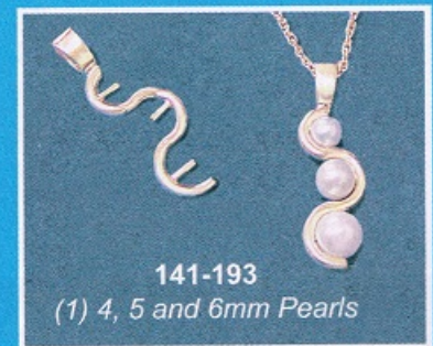
141-193 (1) 4, 5 and 6mm Pearls