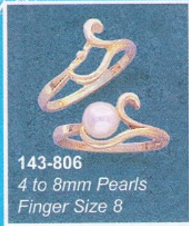
143-806 4 to 8mm Pearls Finger Size 8