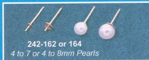
242-162 or 164 4 to 7 or 4 to 8mm Pearls