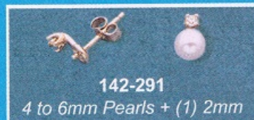
142-291 4 to 6mm Pearls + (1) 2mm